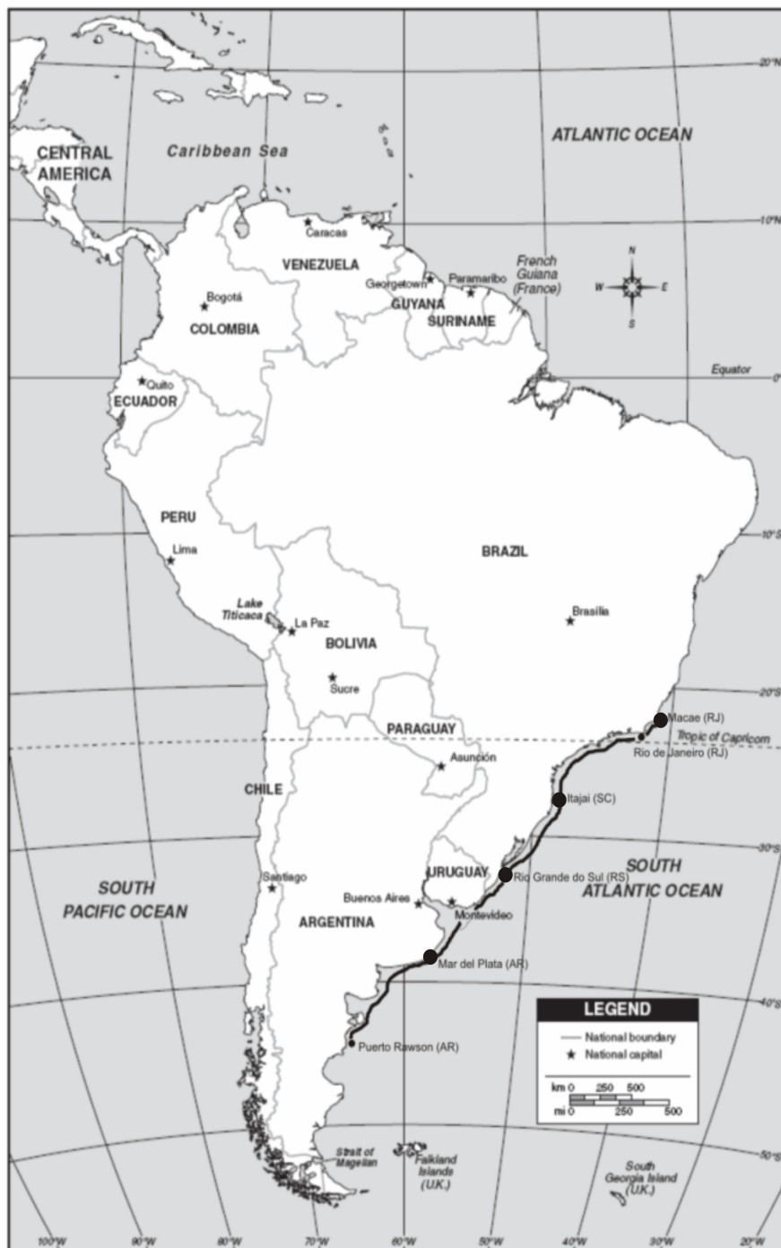
Figure 1. Southwestern Atlantic Ocean and distribution range of A. longinaris (black solid line). Black dots indicate sites where samples were obtained; from Mar del Plata (Argentina, AR) Rio Grande do Sul (Brazil, CZ) and Macaé (Brazil, RJ).

Muscle samples from pereopods and abdomen were removed, fixed in 95% ethanol and stored at 4°C. DNA was extracted using a phenol-chloroform-isoamyl alcohol (25:24:1) extraction of sodium dodecylsulfate (SDS) and proteinase K digested